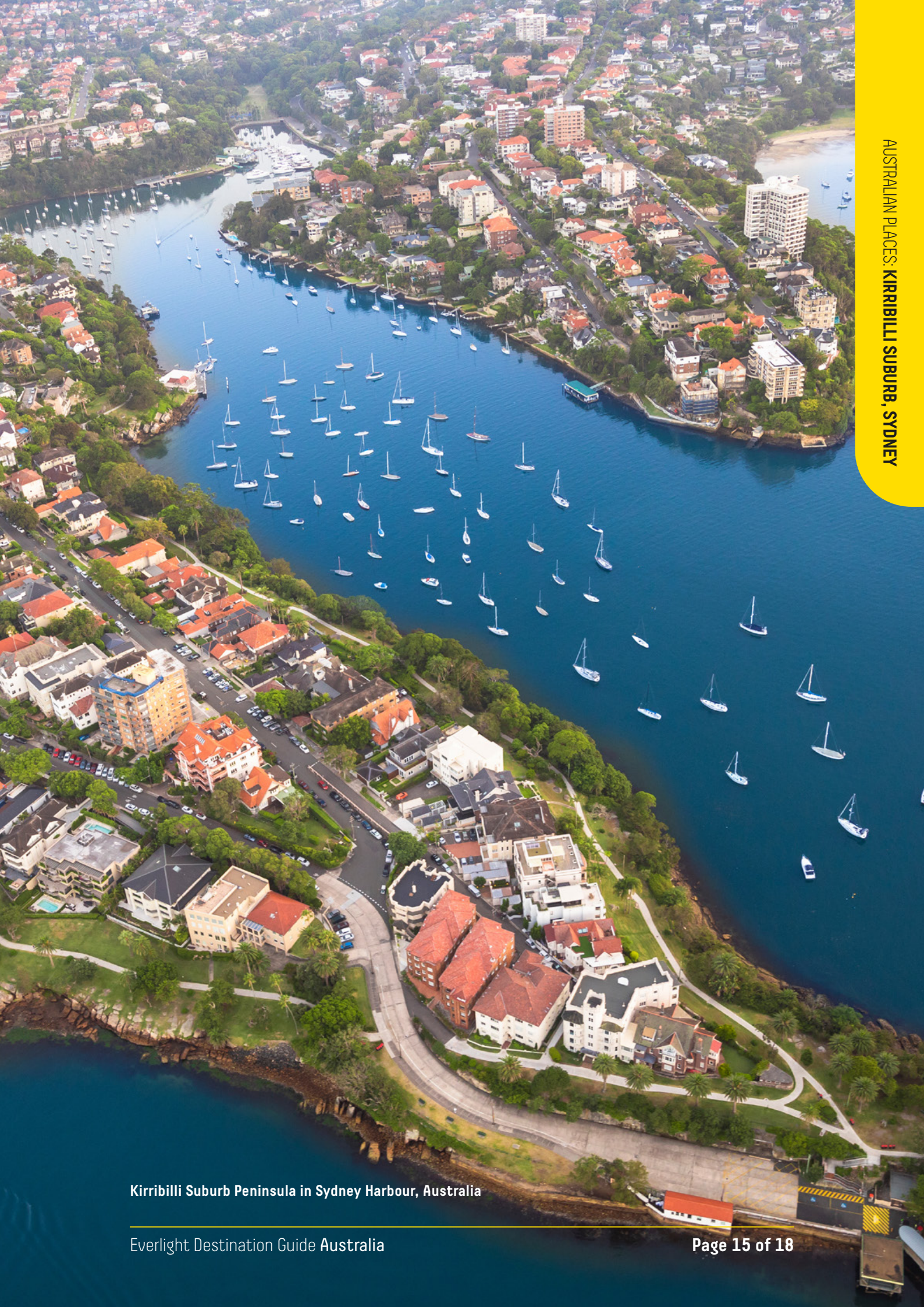
Kirribilli Suburb Peninsula in Sydney Harbour, Australia